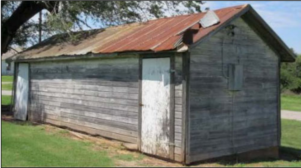
USDA Asset #621800BA08