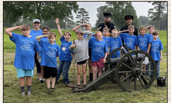
13 students attended the 2024 History Camp

The Fort Towson Historic Site received a $10,000 grant from the Carolyn Watson Rural Oklahoma Community Foundation to support the annual History Camp and to add clothing to the site's living history closet. History Camp is a three-day camp for students ages 9-13. The camp was free in 2024 thanks to the grant. Clothing from the living history closet includes military, women's and children's garments and may be checked out by volunteers to use in OHS programs.